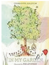
In My Garden Charlotte Zolotow